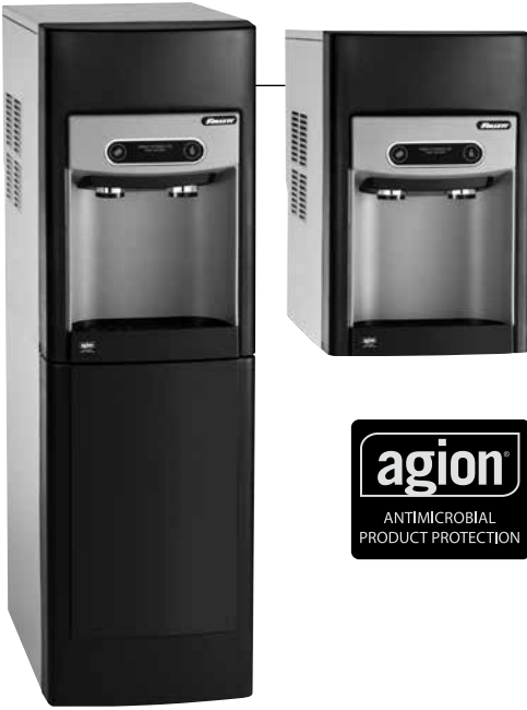
Shown with optional base stand

NOTE: For use in applications with greater than 5 mg/l but less than 400 mg/l total dissolved solids in water and less than 200 mg/l hardness (either naturally occurring or treated with reverse osmosis or other TDS reducing technology). Not recommended for use with softened water.